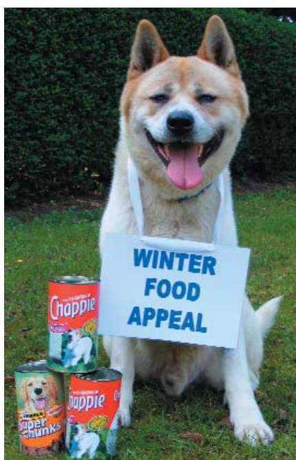
Oliver asks for help

Food collection boxes for anyone interested in donating tinned food during the course of the appeal are situated at key locations around Bristol, including some Co-op, Tesco, Somerfield and Sainsbury's supermarkets; Jolleys, Longwell Green; Bristol & West in Temple