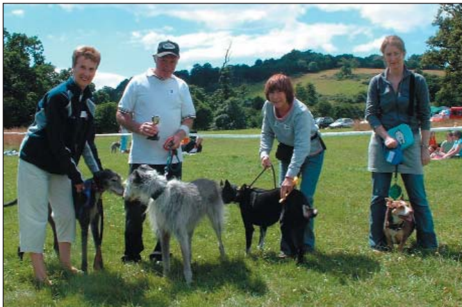
Some of the proud winners from the day

Thanks again to everyone who helped make the day so special and we hope to see you all next year.