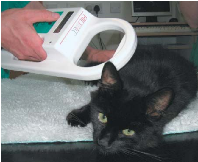
Scanning for microchips