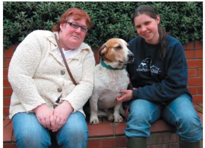
Mitch finds a new home