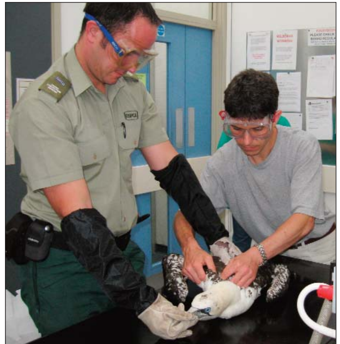
Animal Collection Officer and Senior Veterinary Officer examine the Gannet

This community wind band has been running for over 10 years, playing in venues throughout Bristol, Bath and even as far as Belgium and Budapest! They play for their love of music and for the joy of community