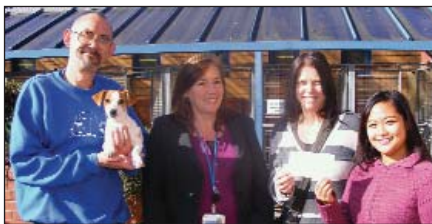
Staff from Capgemini meet one of the animals they are supporting

Members of the Core Services team at Capgemini in Bristol took part in a Pedometer Challenge raising a fantastic £121! Thank you to everyone involved and we hope you enjoyed your walk.